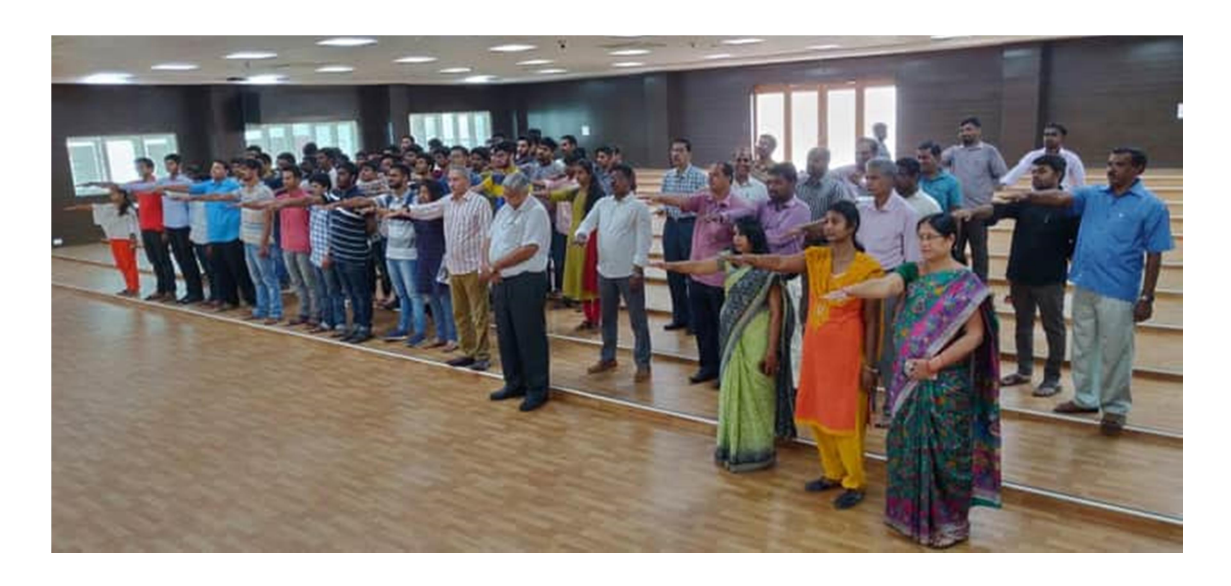
The Vigilance week was conducted in the last week of October 2019