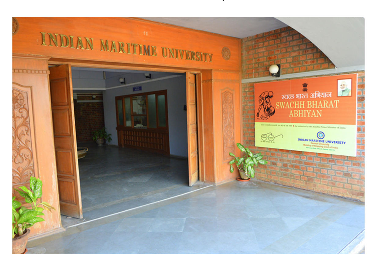
Swatch Bharat Campaign 2019