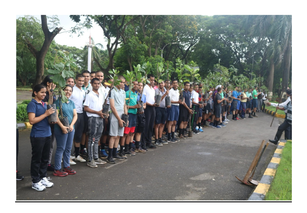
<u>Tree plantation on 15<sup>th</sup> August</u> <u>by New Inductee Cadets</u>