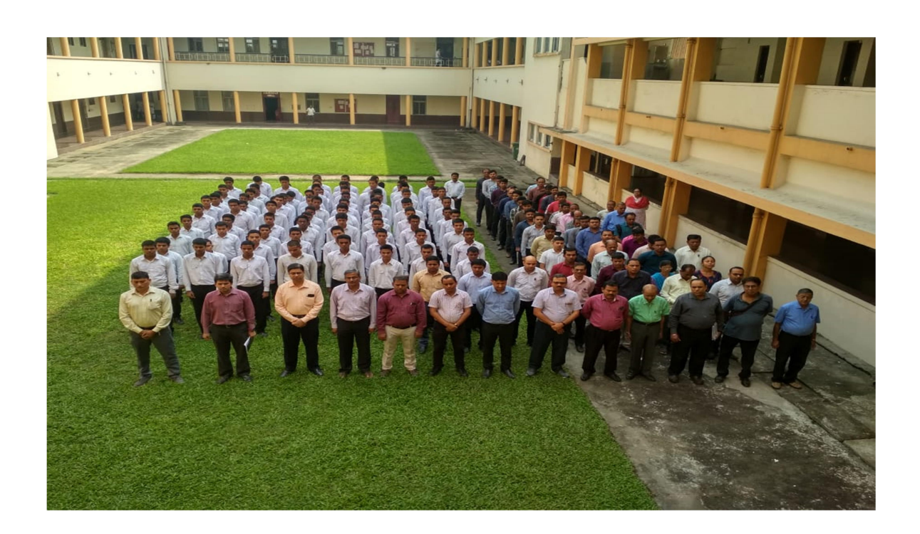
Vigilance Awareness Week