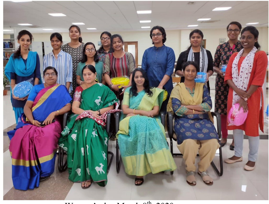
Women's day March 8<sup>th</sup>, 2020