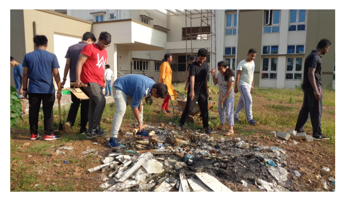
Swatch Bharat programme was conducted for 15 days in the month of September [18th sep.2019 to 30^{th} sep.2019]