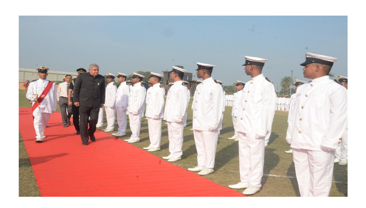
Pre Passing Out Parade