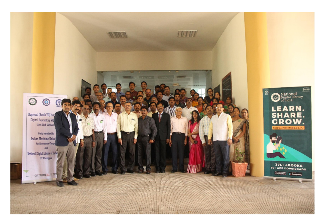
Regional Institutional Digital Repository Workshop, April 22<sup>nd</sup> -23<sup>rd</sup>, 2019 Participants (Library Professionals)