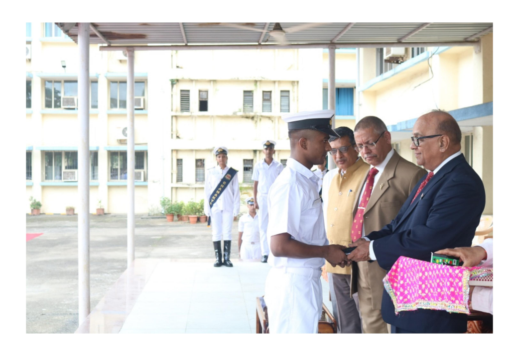
<u>Promise Day Oath Administered by</u> <u>Capt. Sudhir Naphde, Ex Nautical Adviser to Government of India</u>