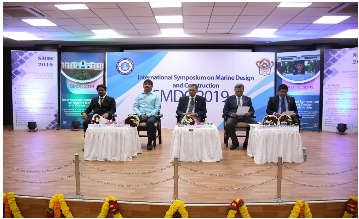
SMDC 2019 (International Symposium on Marine Design and Construction) Dec 5-6, 2019