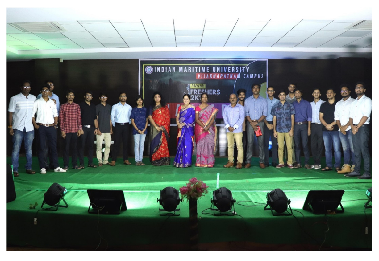
Student's Fresher's day & Teachers day celebration on September 5<sup>th</sup> 2019 Page 89 of 104