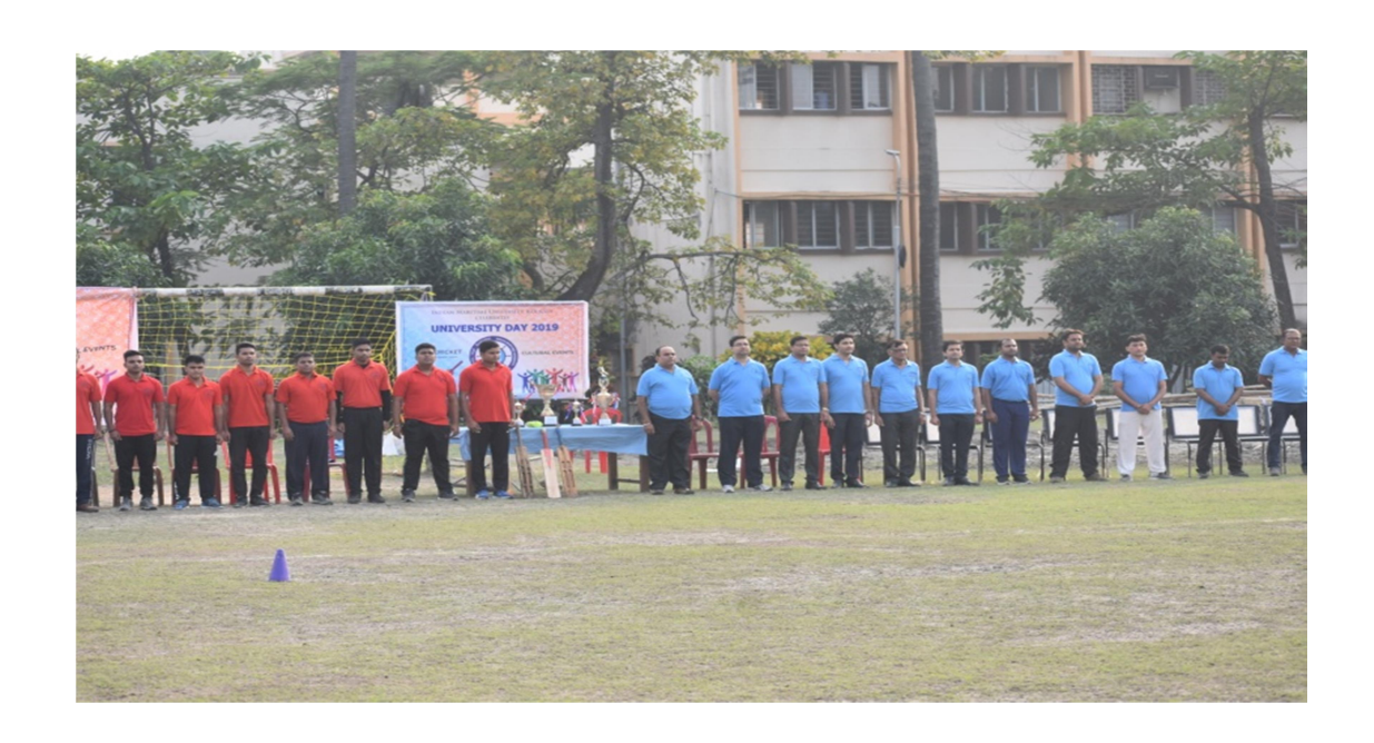
University Day Sports