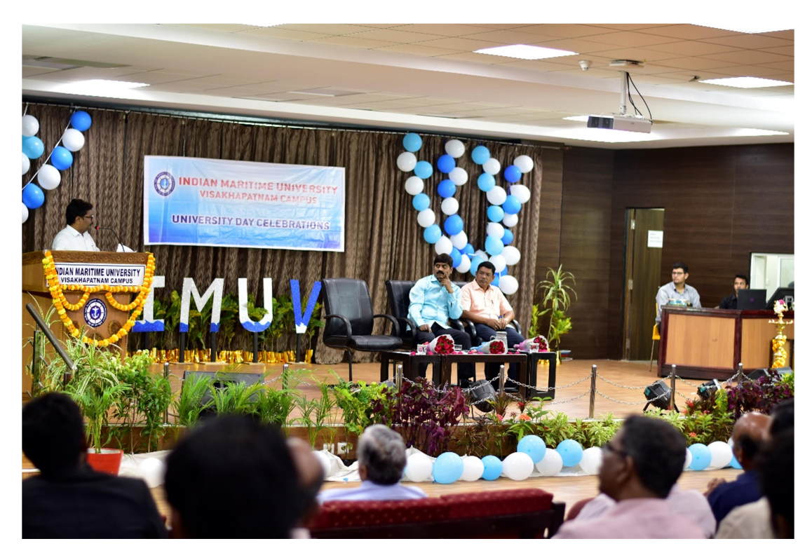
University Day Celebration November 14<sup>th</sup>, 2019