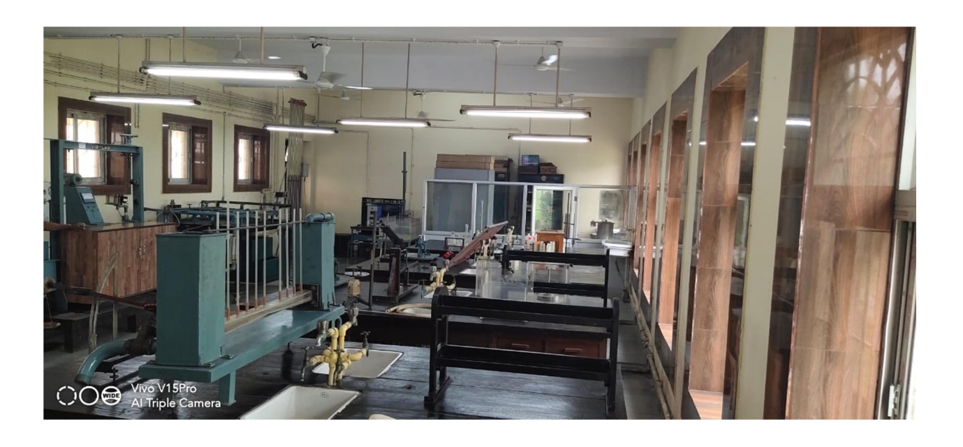
Heat & Chemical Lab