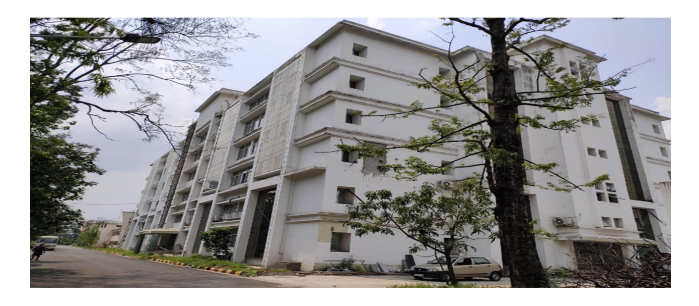
New Administrative Building