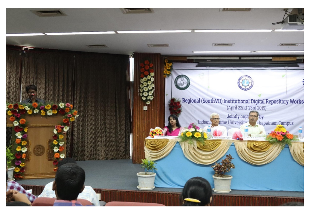
Regional Institutional Digital Repository Workshop, April 22<sup>nd</sup> -23<sup>rd</sup>, 2019 Inaugural Ceremony