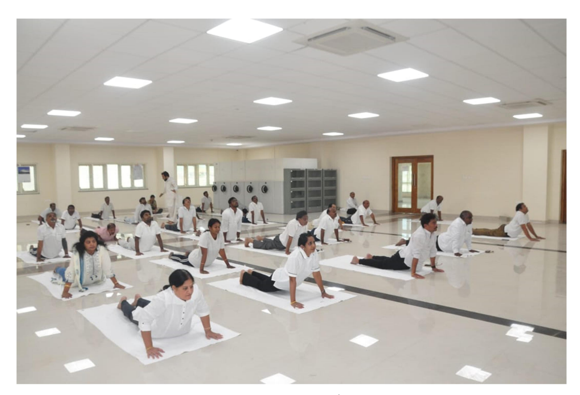
Yoga day June 21st, 2019