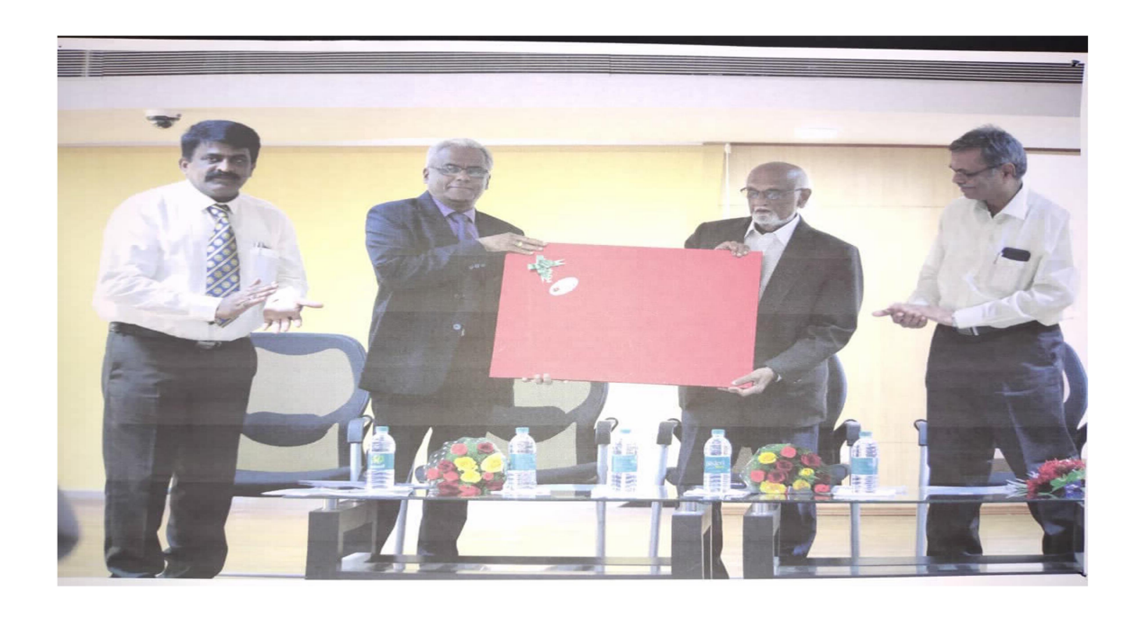
Guest Lecture on "Fascinating Facts about Energy" on 10th February 2020