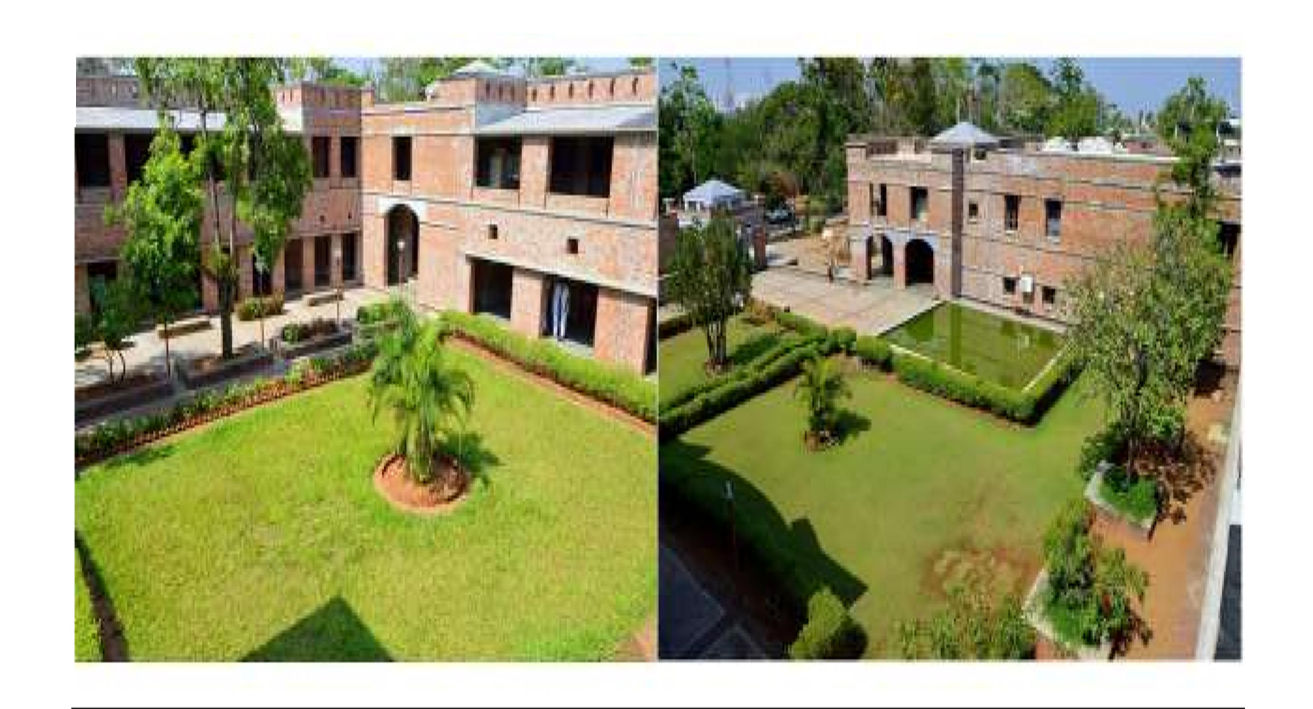
IMU Chennai Campus